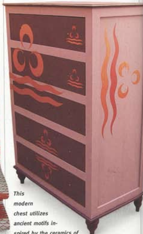
This modern chest utilizes ancient motifs inspired by the ceramics of the Ottoman Empire. $1,895. Sheherazade: 212.539.1771 or sheherazadenyc.com.